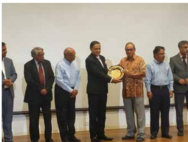
Law Career Seminar 2019