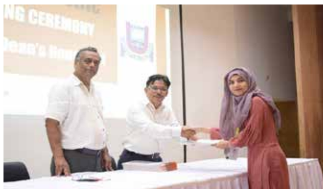
Vice Chancellor's Award and Dean's Award.