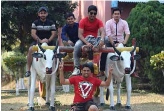
Annual Picnic, 2019

held on July 28, 2019 when the Law Festival of the Department will be held.