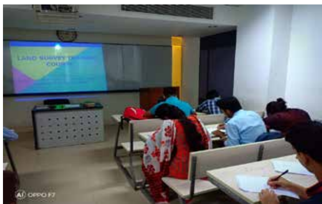
Land Survey Training Program

The Department organizes training in Bar Vocational and Land Survey for professional skills development of the students to make them competent in the law profession.