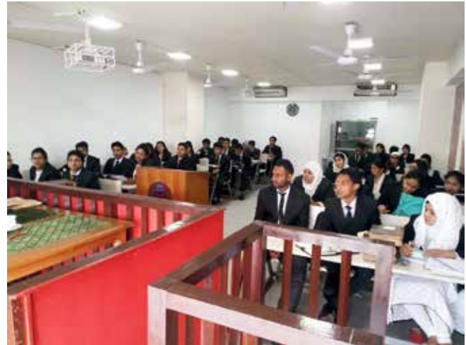
L&HR Students in front of Bandarban & Cox's Bazar District & Session Judge Court

The Department's annual picnic is an event of joy, in each all the enrolled students of the department participate in the annual picnic. In January 2019 more than 300 students, faculty members and staff of the Department went to a picnic at Shohag Polli, Gazipur, Dhaka.