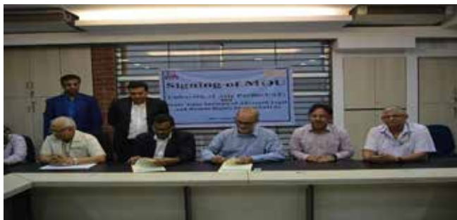
Memorandum of Understanding (MoU) signed between UAP and UMSAILS on 28 April 2019