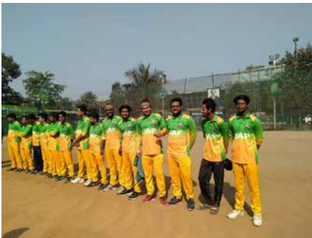
UAP LAW & HR Cricket Team