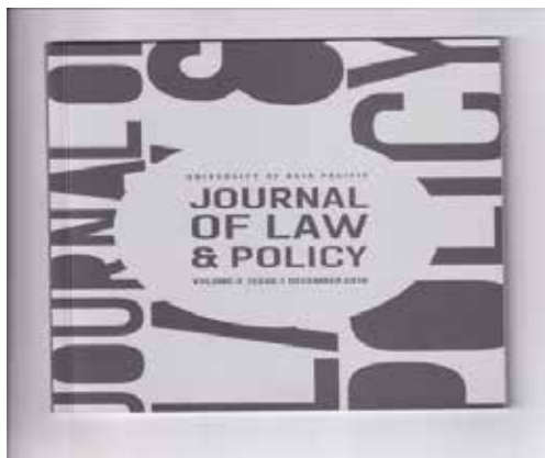
Journal of Law & Policy, Volume 3, Issue 1, December 2018

that “the journal is of international standard”.